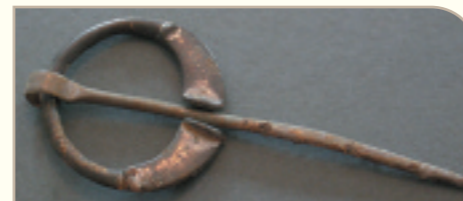
Penannular brooch from Castlefarm .