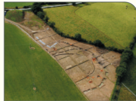
Aerial view of Castlefarm with some ditches visible as cropmarks in adjacent field.

The M3 Clonée-North of Kells Road Scheme is about 60 km long and archaeological excavation of 160 new sites identified by previous archaeological investigations along the route has been underway since autumn 2005. Extra geophysical surveys at a number of sites by Target Archaeological Geophysics , revealed the full extent of a large enclosure at Castlefarm , a prehistoric settlement at