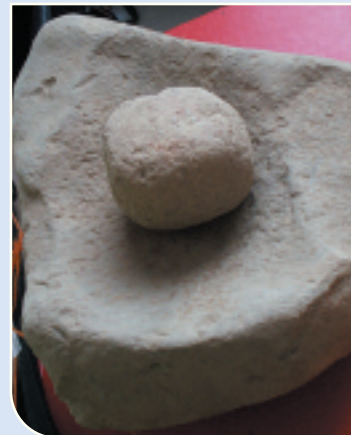
Saddle quern with grinding stone from Grange .

Finds from the excavation include Bronze Age pottery, a stone adze, a grinding stone and a stone pendant.