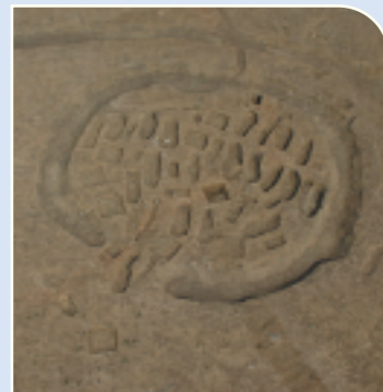
Elevated view of ring-ditch and grave cuts of burials at Ardsallagh .