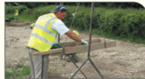
Dry sieving of topsoil at Boyerstown .

Archaeological, historical and palaeoenvironmental research is being undertaken to ensure that the vast amount of data being generated by the M3 archaeological investigations will be placed in context and therefore transformed from information to knowledge. Further details of the ongoing investigations can be found on a dedicated website: www.m3motorway.ie