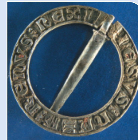
Medieval silver ring brooch from Boyerstown showing inscription on front.