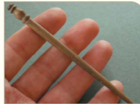
Bone stick pin with turned head from Castlefarm .

11 burials were also recorded at the site, seven of which were buried in the Christian fashion - on their backs and oriented east-west.