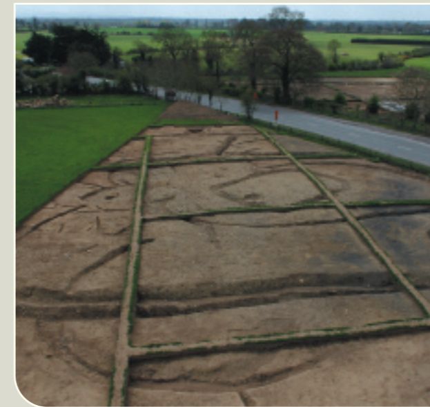
Elevated view of Roestown post-excavation.