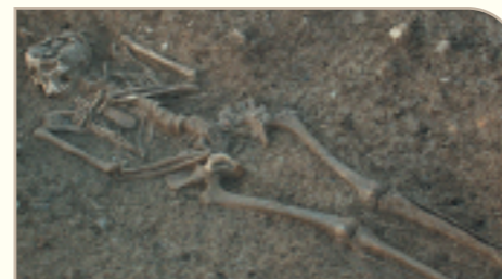
Excavated burial at Castlefarm .