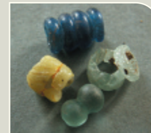
Selection of beads from Roestown .