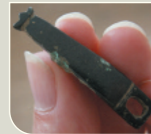
Metal clasp from Roestown .