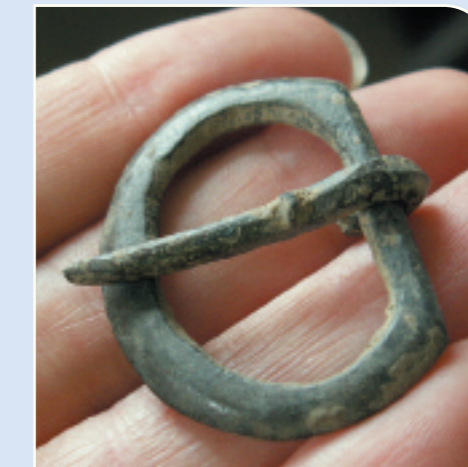
Medieval metal buckle from Boyerstown .

women to fasten clothing. The brooch is typically tiny, only 3 cm diameter. The inscription on the front of the brooch is in Latin, IESVS NAZARENVS REX I, and is a shortened version of the titulus - the inscription placed above the head of Jesus Christ at his crucifixion which translates as 'Jesus of Nazareth, King of the Jews'. In the middle ages such inscriptions were not simply a reflection of religious devotion but were also believed to have amuletic properties - in this case a defence against violent death or sudden harm.